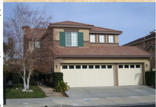
Home Painted with Approved Colors