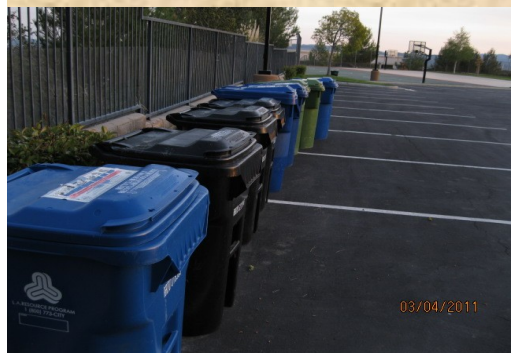
Lost Trash Bins in Parking Lot