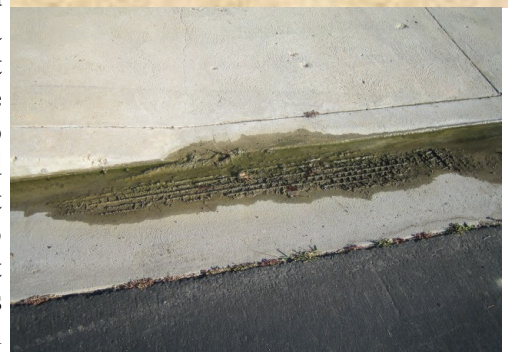
Mud and Debris in HOA Gutters.